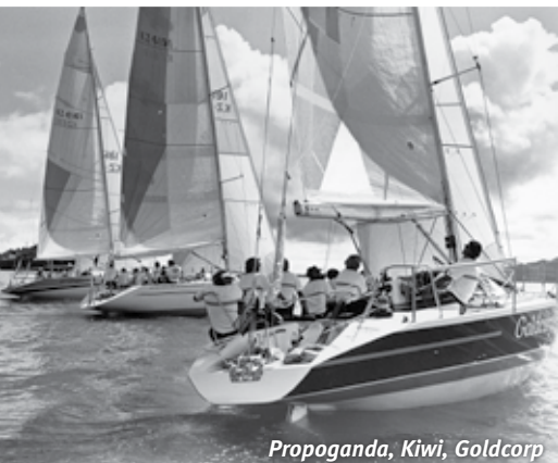
Propoganda, Kiwi, Goldcorp

Undoubtedly the most exciting news, though, is the proposed South Pacific Mini circuit (see adjacent story). The circuit is admittedly only at the embryonic stage, but how good would it be to follow a fleet of courageous solo sailors bobbing about the South Pacific Ocean and the Tasman Sea in 6.5m canting keelers?